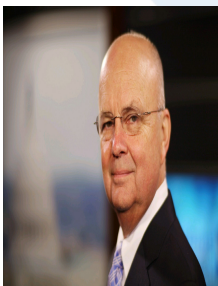
General Michael Hayden

Former Director of the Central Intelligence Agency